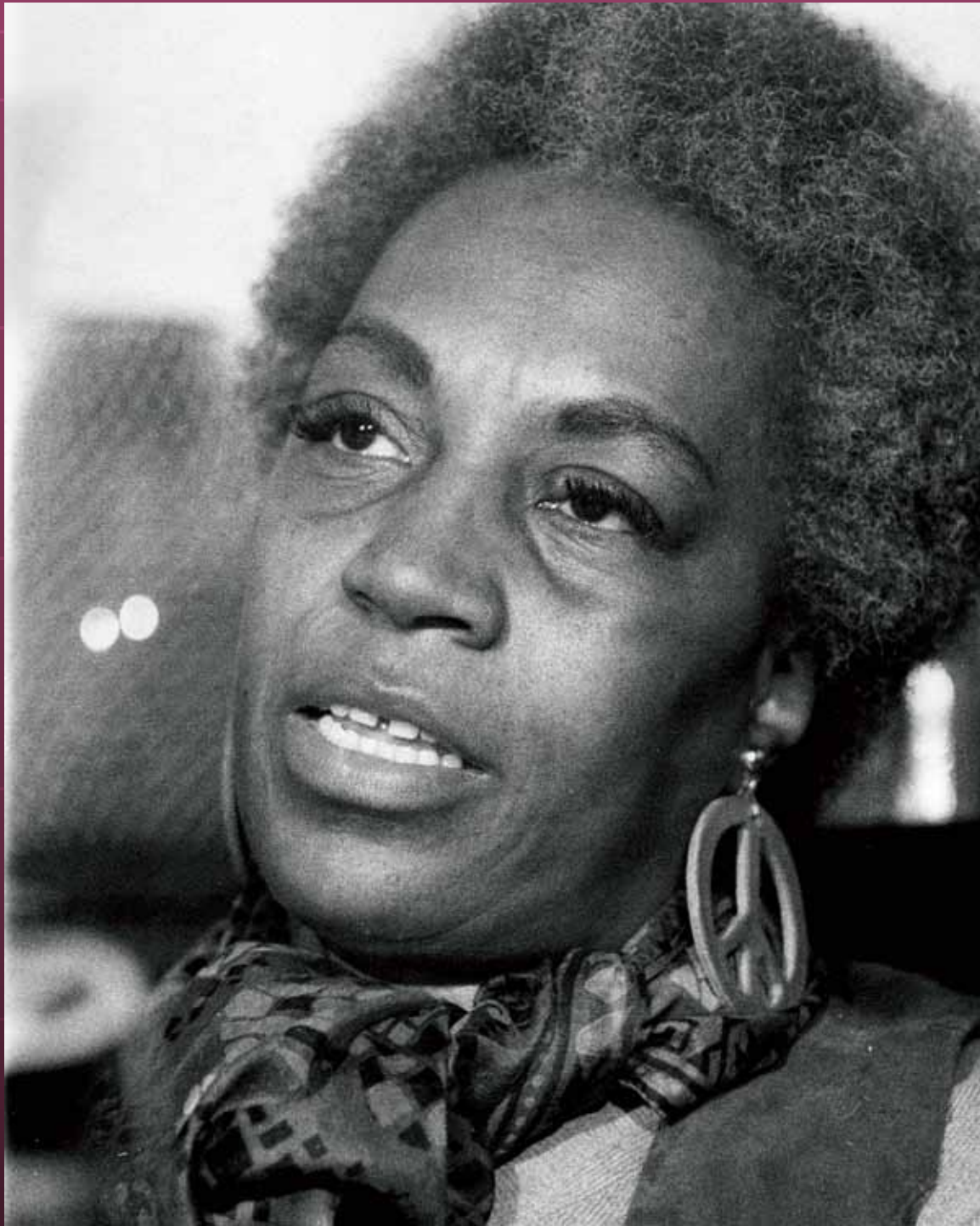
Florynce R. Kennedy (1916 - 2000)

Florynce Rae Kennedy was a civil rights attorney and feminist activist. Her controversial tactics and provocative tone drew criticism, but also helped publicize national debates on abortion, racism in the media, women's equality, and consumer protection. Kennedy became one of the first African-American women to graduate from Columbia University's law school. She represented activists such as H. Rap Brown and members of the Black Panthers as well as the estates of Billie Holiday and Charlie Parker against record companies that had withheld royalties. Kennedy later became an integral part of the feminist movement beginning in the 1970s. She toured the country on the lecture circuit, often with friend and fellow activist Gloria Steinem, while continuing to lead protests, including a rally outside the 1976 Democratic National Convention in New York.