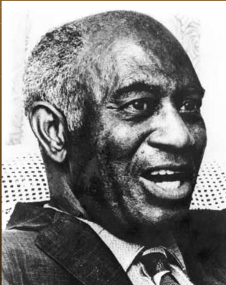
Melvin B. Tolson (1898 - 1966)

Melvin B. Tolson became the first Poet Laureate of the Republic of Liberia. Born in Moberly, Mo., Tolson spent his junior and senior years at Kansas City's Lincoln High School. He later studied at Fisk University, Lincoln University in Oxford, Pa., and Columbia University. From 1923-1947, Tolson taught English, directed plays and coached the debate team at Wiley College in Marshall, Tex. In 1935, his team beat the defending national champions from the University of Southern California, a victory that became the basis for the 2008 Denzel Washington movie The Great Debaters . In 1944, Tolson published his first collection of poetry, the well-received Rendezvous with America . He also wrote A Gallery of Harlem Portraits , Libretto for the Republic of Liberia , and Harlem Gallery .