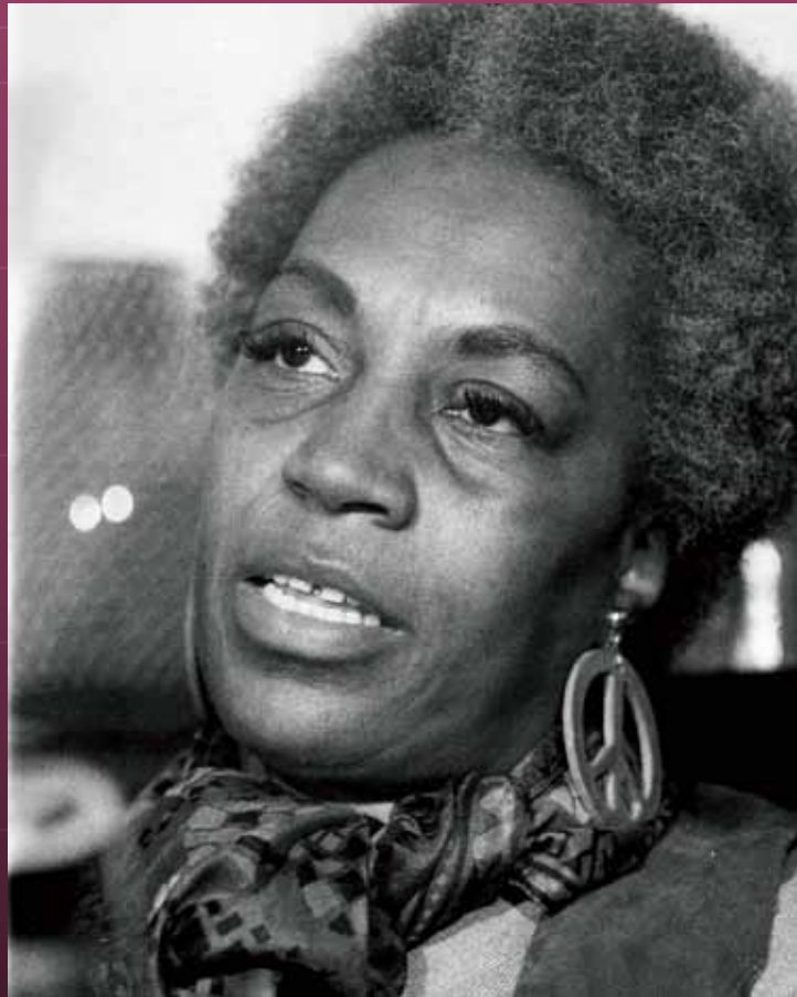
Florynce R. Kennedy (1916 - 2000)

Florynce Rae Kennedy was a civil rights attorney and feminist activist. Her controversial tactics and provocative tone drew criticism, but also helped publicize national debates on abortion, racism in the media, women's equality, and consumer protection. Kennedy became one of the first African-American women to graduate from Columbia University's law school. She represented activists such as H. Rap Brown and members of the Black Panthers as well as the estates of Billie Holiday and Charlie Parker against record companies that had withheld royalties. Kennedy later became an integral part of the feminist movement beginning in the 1970s. She toured the country on the lecture circuit, often with friend and fellow activist Gloria Steinem, while continuing to lead protests, including a rally outside the 1976 Democratic National Convention in New York.