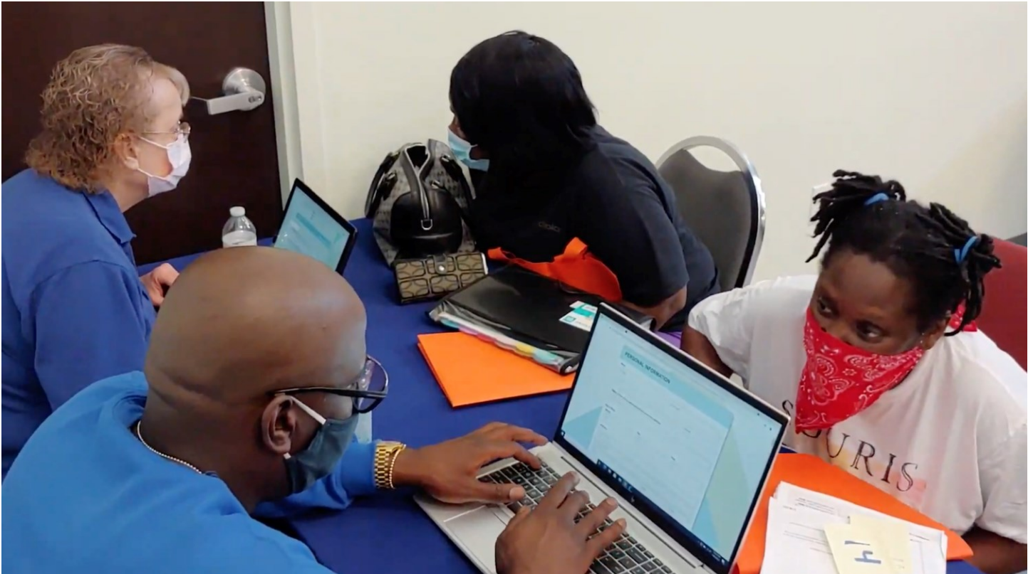
Members of LINC's team process applications for utility bill assistance in June 2021.

It started slowly, but once federal pandemic aid for rent and utilities began reaching Americans in need, more than 80% went as designed to low-income households, according to the U.S. Treasury Department.