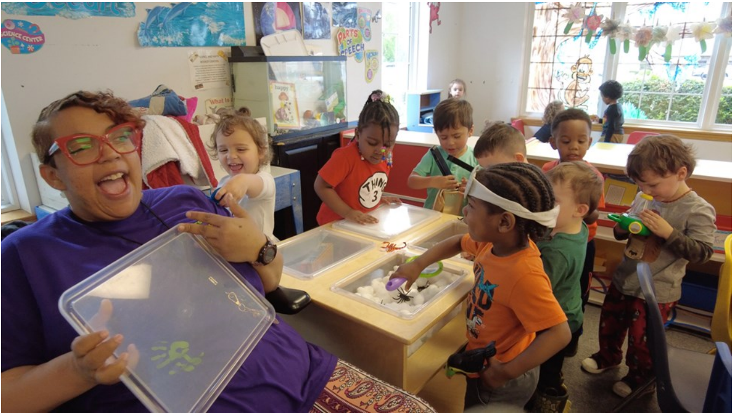
Children at Young Professor's Preschool in Raymore find hidden toy spiders and scorpions in a bin of cotton balls and tease their teacher who says she's scared of spiders.