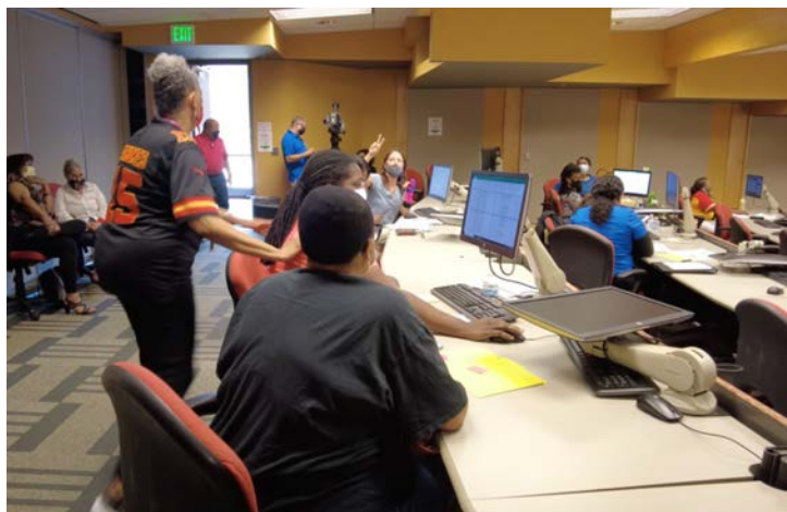
Workers at Kansas City's emergency rental assistance center help customers in September 2021.

Later that summer, the City of Kansas City created similar clinics to speed the process and by October 2021 had distributed more than 80% of the $25 million in relief allotted to Kansas City.