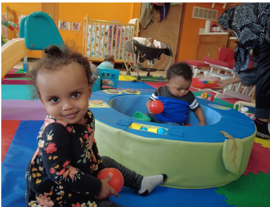
Children play at Mercy Child Care Center in Kansas City, where the ITSN lessons on embracing diverse cultures are highly prized.