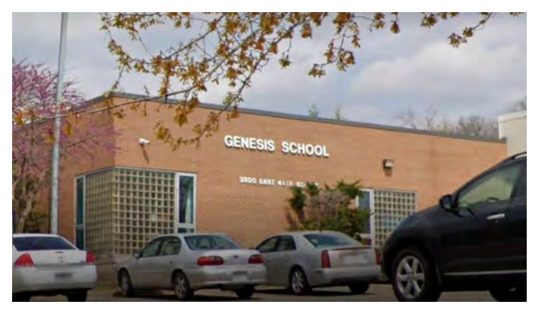
The Missouri Board of Education voted to close Genesis charter school, on Kansas City's East Side, after years of low academic performance.

Genesis sued the state board and its sponsor, the Missouri Charter Public School Commission, arguing that officials violated the law in closing the K-8 school.