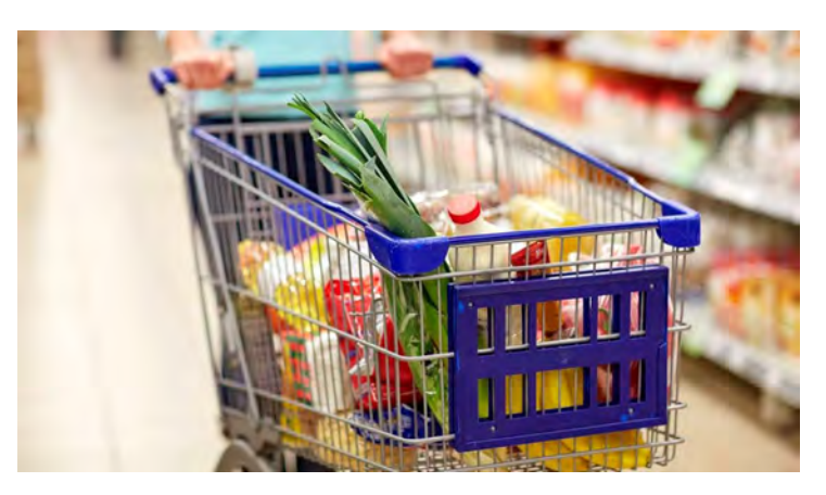
A grocery cart. Congress is poised to expand work requirements for food assistance to include older adults.

The deal negotiated by Democratic President Joe Biden and Republican House Speaker Kevin McCarthy requires able-bodied individuals ages 50 to 54 without children at home to work or receive job training to remain eligible for the Supplemental Nutrition Assistance Program, formerly known as food stamps. More than 666,000 Missourians get help paying for groceries under the program and the work rules currently only apply to those 18 to 49.