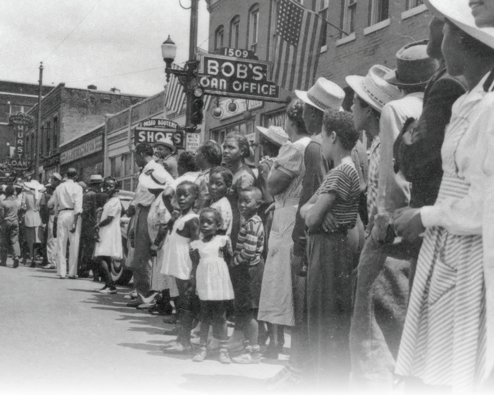
Circa 1938 photograph of the Black Elks parade crowd on south side of 18th Street, between The Paseo and Vine Street, Kansas City, MO.