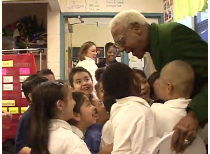
Buck "O'Neil embraces children at Kansas City's Primitivo Garcia Elementary School in 2006.