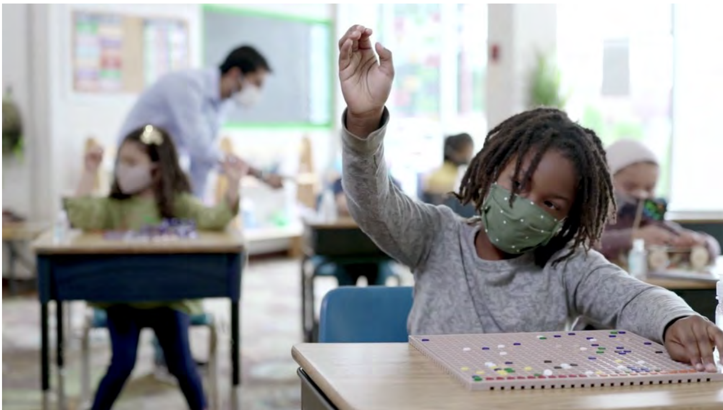
Image from the video in the newly released report: The Impact of Lost Instructional Time from the COVID-19 Pandemic in the State of Missouri.

It's as severe as the education community feared.