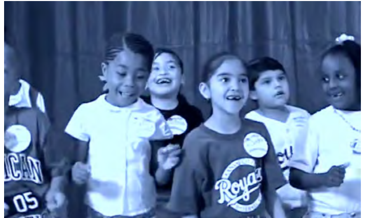
From the Hero Project video, children at Primitivo Garcia Elementary sing, "Give it up! for Buck O'Neil."