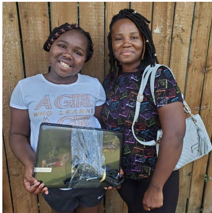
Two customers after receiving a low-cost device from PCs for People.

The deadline to apply is Aug.12 by 5 p.m.